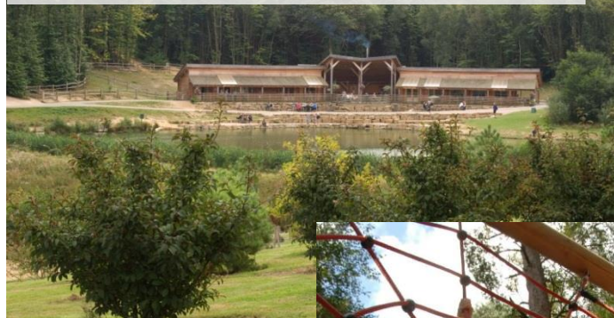
Visitor hub, café and bike shop