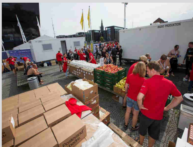
foto: fresh water in cardboard cartons

Guidelines for organising environmentally friendly events